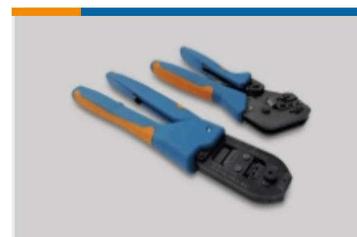
Hand Crimping Tools(2)